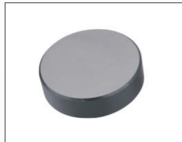
Ø60mm Flat Anvil