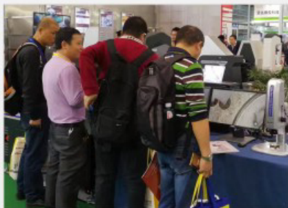
SIMM Machinery Fair