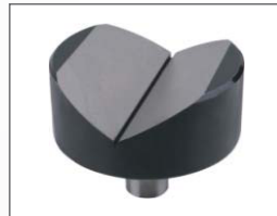
Ø40mm V-shape Anvil