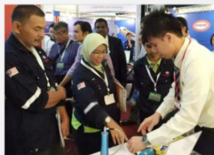
ASEAN International Machine Tool Fair