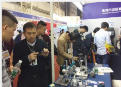
DMP Tooling and Machining Fair