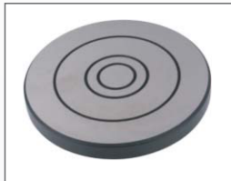
Ø150mm Flat Anvil