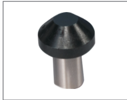
Small Flat Anvil