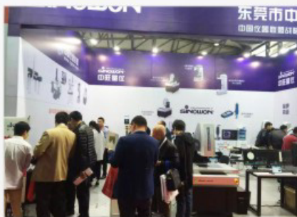
CCMT China CNC Machine Tool Fair