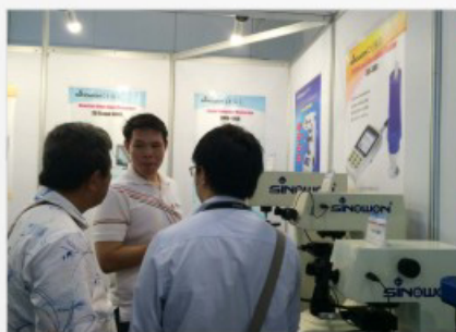
Intermach Metal Processing Machinery Fair

Sinowon is Committed to Make Measurement More Accurate and Uncomplicated!