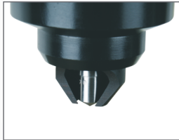
Indenter Protector Cap