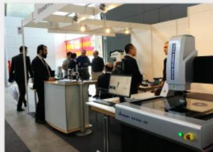
Control Stuttgart Quality Control Fair